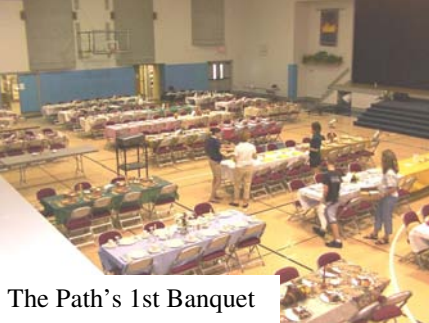
The Path's 1st Banquet

We have been truly blessed this year within our mission. With the much needed help of our supporters , we've been able to improve and grow! This year we succeeded in moving our office out into the garage area, making more room in the women/children's house. We have been able to add staff, not one but two part-time night administrators to help ensure safety, as well as guidance, counseling , life skill classes and childcare. We have been blessed with a van to transport our clients for job search, work, bible study and church services. We have a proposed land site for farming and equipment to start, come this new year. We have been able to bless our families with donated cars, to help them maintain work. It is very evident without the faith, love and support of all our supporters, we would not be here with our doors open, helping with the needs of our community. Our supporters help make all this possible. We thank you for helping us to help others. Our prayer is... that God continues to pour out His blessings on you, fulfill your needs and keep you safe. May His presence always be known and with you always. Thank you, from all of us here at the Path