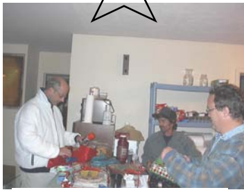
Men's Christmas 2003